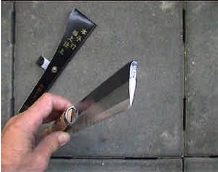
Bamboo Cutting Knife. This tool is a typical Japanese knife with a wedged shape made specifically for working with bamboo.