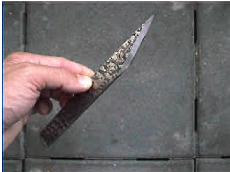
All Purpose Craft Knife. This example is a Japanese knife with a single beveled side.