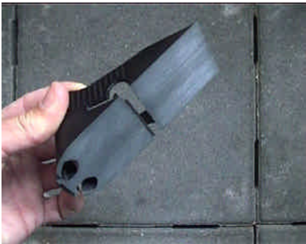
Small Plane. This tool is a light weight aluminum model.