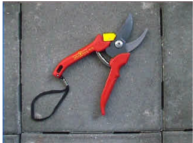
Pruning Scissors. These are very handy for quick cutting of smaller strips of bamboo.