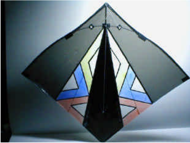
Ralph painted the white Orcon with acrylics