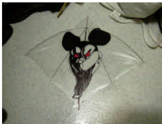
Jeff Gandee painted Orcon with acrylics