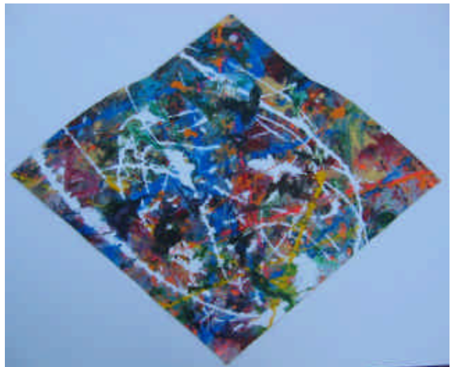
Dennis Crowley used acrylics on Tyvek