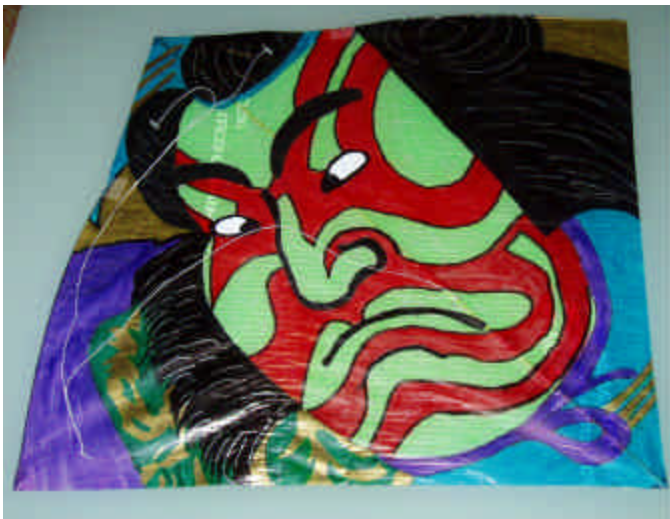
Mike Wyatt used acrylics on white Orcon

The following are a few examples of what kite makers have done with acrylic paints, dyes and inks; you can see more decorating ideas on the photo gallery page.