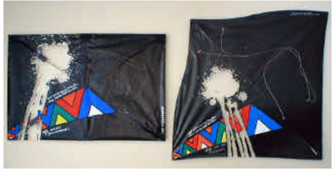
These two kites Ralph painted acrylics on black polyfilm after using bleach to create the clear patch.