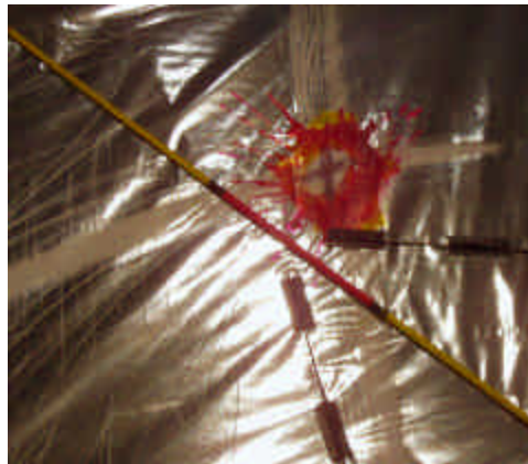
Dennis Crowley used a combination of acetone to remove the color from the black polyfilm and acrylic ink and paint for color. You can see the acrylic painted spine on the back of his kite.