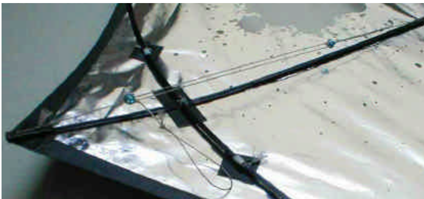
Ralph Resnik used his version of Scott's tensioning method on this kite.

As you can see in the photos, there are only a few methods that are used. The most popular and probably the easiest to make is the tensioning line with beads that Scott Bogue developed, shown above. The beads are used both as pulley's and by wrapping the line around the 'slider' bead it provides enough friction to minimize the tension line from slipping.